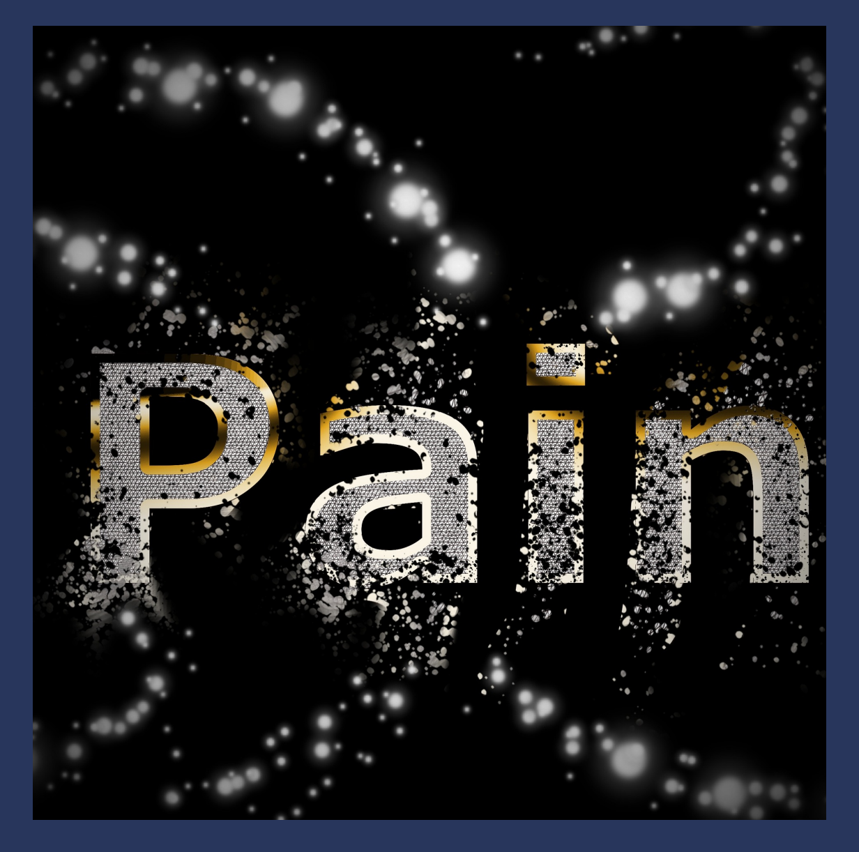
The P.A.I.N. of First Impressions