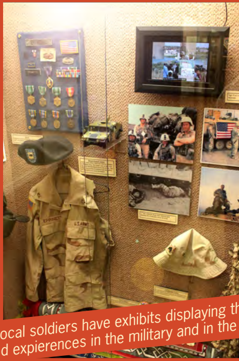
Many local soldiers have exhibits displaying their time and experiences in the military and in the war.