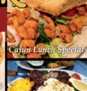
Cajun Lunch Specials